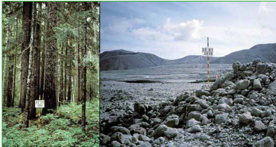
Mount St. Helens, before and after

Bangor Theological Seminary, as we know it, will never be the same again. Many if not most of us have found ourselves and our paths forever changed. For me, it's been a difficult time and the trajectory