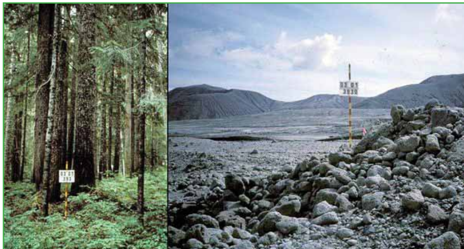
Mount St. Helens, before and after

Bangor Theological Seminary, as we know it, will never be the same again. Many if not most of us have found ourselves and our paths forever changed. For me, it's been a difficult time and the trajectory