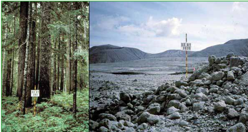
Mount St. Helens, before and after

The change was dramatic. Still miles away from the volcano, the devastation was clear. All I could see was gray. Bleak, dead, ash-