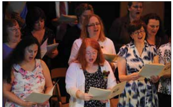
Members of the class of 2011 and BTS Choir sing during the Baccalaureate Order of Service.